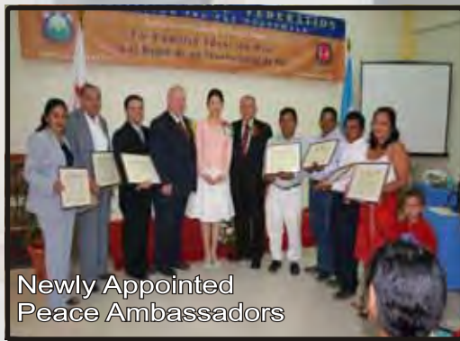
Newly Appointed Peace Ambassadors